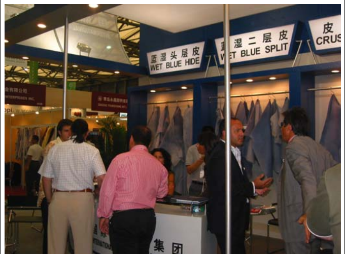
INTERNATIONAL LEATHER SPLIT GROUPWARE - W3/G10